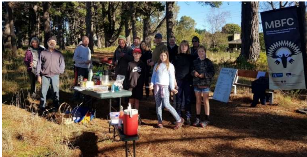
Merricks Beach Foreshore Reserve Committee of Management