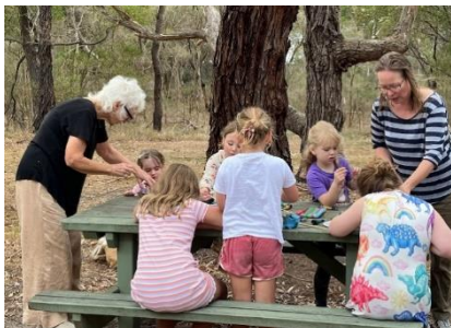
A small crowd of eager children painted and decorated eggs.

Friends of the Bill Carroll Reserve held their annual Easter in the Park on Easter Sunday.